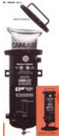
DeVilbiss CT30 Desiccant Air Dryer

Moisture also can be removed effectively from compressed air using a chemical air dryer. Passing air through a desiccant (water-absorbing material) can reduce water vapor content significantly.